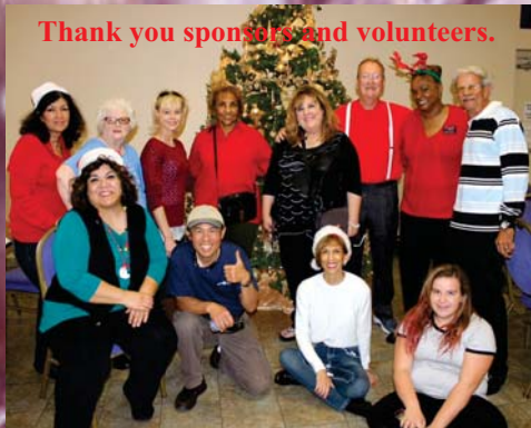
Thank you sponsors and volunteers.